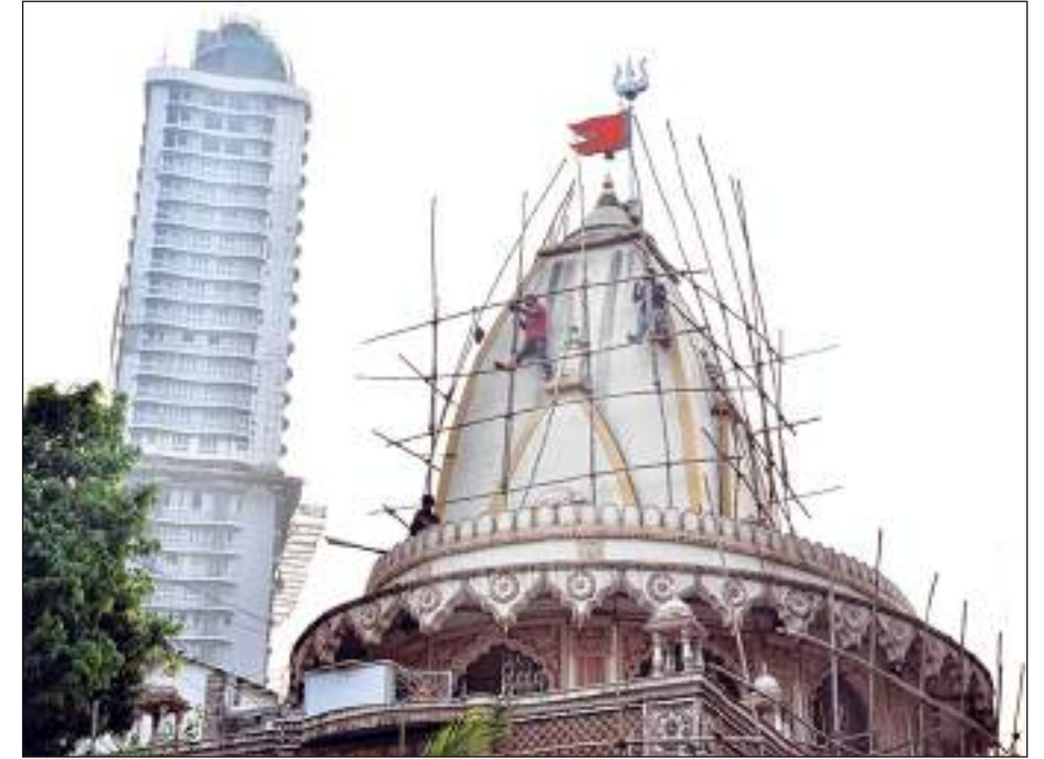
Renovation work of the Gol Deval temple, which is dedicated to Lord Shiva, is in full swing