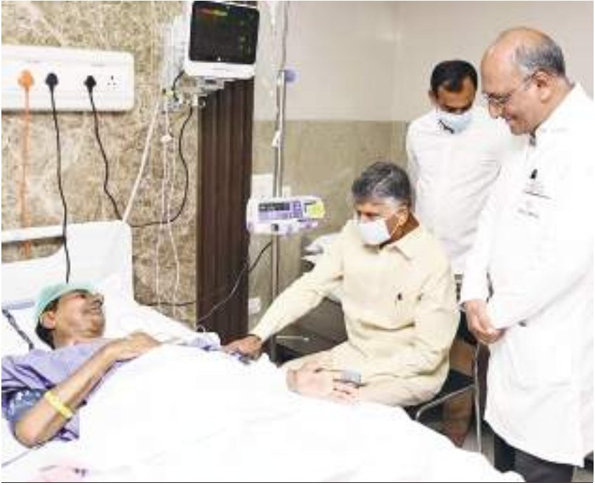
TDP Supremo and former Chief Minister N Chandrababu Naidu on Monday called on former Telangana State CM and BRS president K Chandrasekhar Rao who is recovering from a hip joint replacement surgery at a private hospital in Hyderabad. Chandrababu Naidu enquired about KCR's health and wished him a speedy recovery. Later speaking to media persons, Chandrababu Naidu hoped that KCR would recover fast and would continue his work with the people.