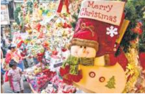
People purchase decorative items ahead of Christmas

The Willingdon Catholic Gymkhana in Santacruz, known for its big presence in sports, goes all the way with cultural events during Christmas, with events lined up till New Year's Eve. The festival season at the gymkhana, which has around 7,000 members, start-