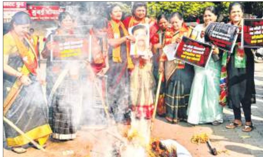
BJP women workers in Latur staged a protest against Congress Rajya Sabha MP Dheeraj Sahu, who is at the centre of a massive cash haul exceeding ₹353 crore