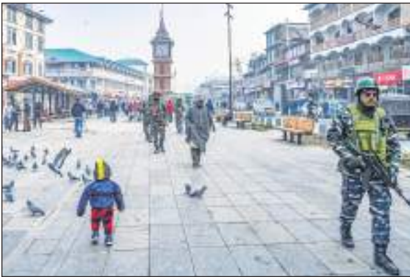
Security men keep a vigil in Srinagar on Monday

A parliamentary panel has recommended to the Centre to explore the possibility of permitting worship at ASI-protected monuments having "religious significance" if it can be established that this would not have a detrimental effect on their conservation.