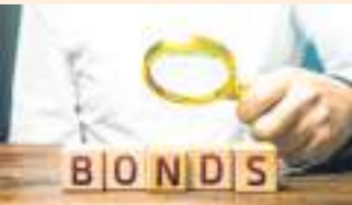
INFORMIST / Mumbai

Prices of government bonds ended lower, tracking a rise in US Treasury yields, dealers said. Meanwhile, traders refrained from placing aggressive bets due to lack of significant domestic cues after the outcome of the Monetary Policy Committee's meeting on Friday.