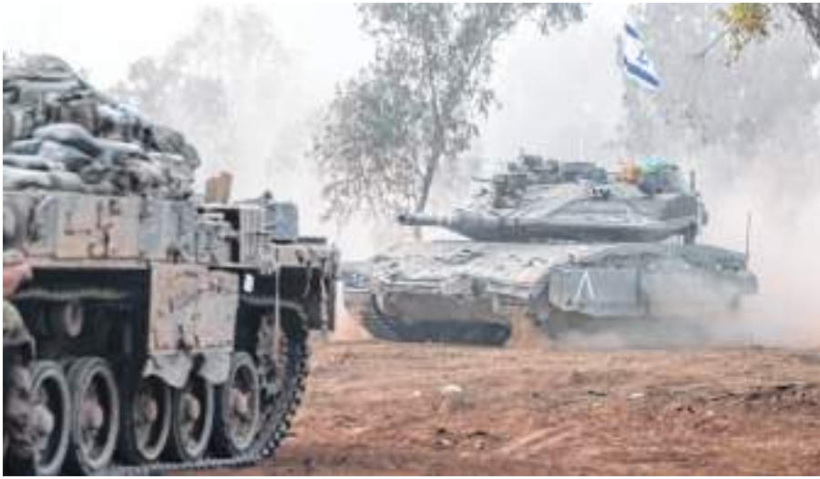
Israeli army tanks rolling in a field near the border with the Gaza Strip on Monday

Residents said there was heavy fighting in and around the southern city of Khan Younis, where Israeli ground forces opened a new line of attack last week, and battles were still underway in parts