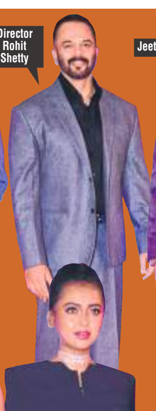
Director Rohit Shetty