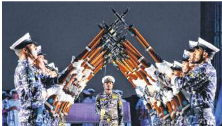
A Beating Retreat and Tatoo Ceremony (BRTC) was held as part of the Navy Week at Gateway of India on Monday evening. The celebration will continue till Dec 14.