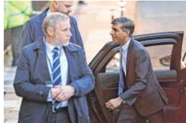
Britain's Prime Minister Rishi Sunak arrives at the UK Covid Inquiry, in west London, on Monday

"I just wanted to start by saying how deeply sorry I am to all of those who lost loved ones, family members