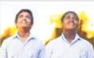
A still from Kastoori: The Musk