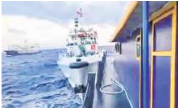
A Chinese ship rams a Philippine navy-operated supply boat

More than 100 Chinese government and suspected militia ships have swarmed the high seas around the con-