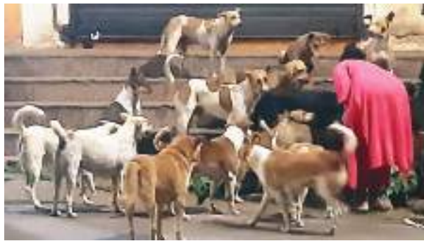
File photo of stray dogs in the commercial capital.

For, it would be three long years on December 31, 2023 that the MoU with the city-based animal welfare organisation had expired, with the civic body just groping in the dark over the question of rop-