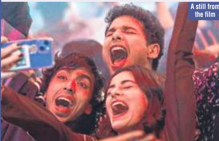
A still from the film

The Kho Gaye Hum Kahan cast and team unveil a thrilling trailer filled with music and festivities