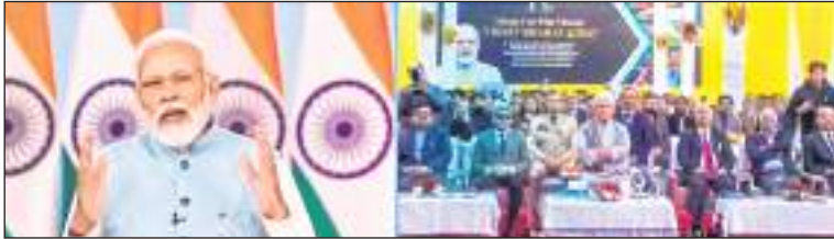
Prime Minister Narendra Modi speaks during the launch of 'Viksit Bharat @2047: Voice of Youth' on Monday

"In the life of any nation, history provides a time period when it can make exponential strides in its development journey. For India, the Amrit Kaal is ongoing and this is the period