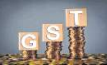
INFORMIST / New Delhi

The implementation of the Goods and Services Tax has contributed to heightened tax buoyancy at the state level, but states need to strengthen their tax collection capacity through reforms and effective and innovative administration, a study by the Reserve Bank of India says.