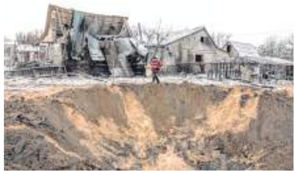
Communal workers walk next to a crater and destroyed houses following Russian shelling in Kyiv, on Monday

The attack also left 120 households in the city without electricity, Ukraine's Ministry of Energy said.